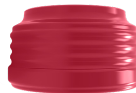
7" DRIVE & GP TRAILER